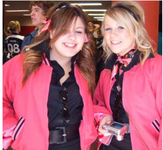
Dressed up and having fun on the last day